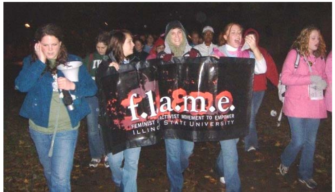
F.L.A.M.E. members at Take Back the Night on October 13